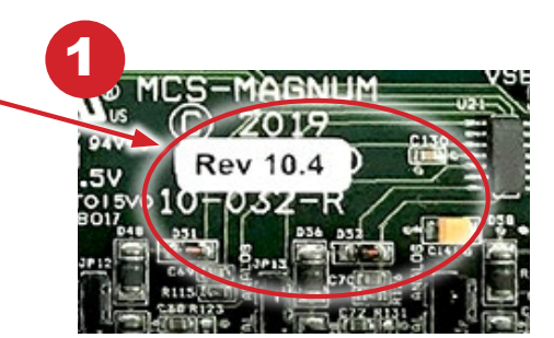
FIGURE 2 MAG-KEYPAD-REPLACEMENT

(J4 Pins populated for +12 VDC. top two pins covered (Magnum HW REV 7 or higher, )